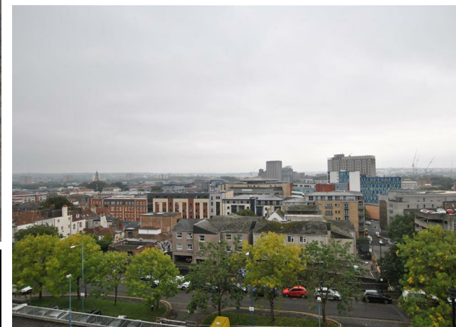
Carolina House Dove Street, Bristol ,